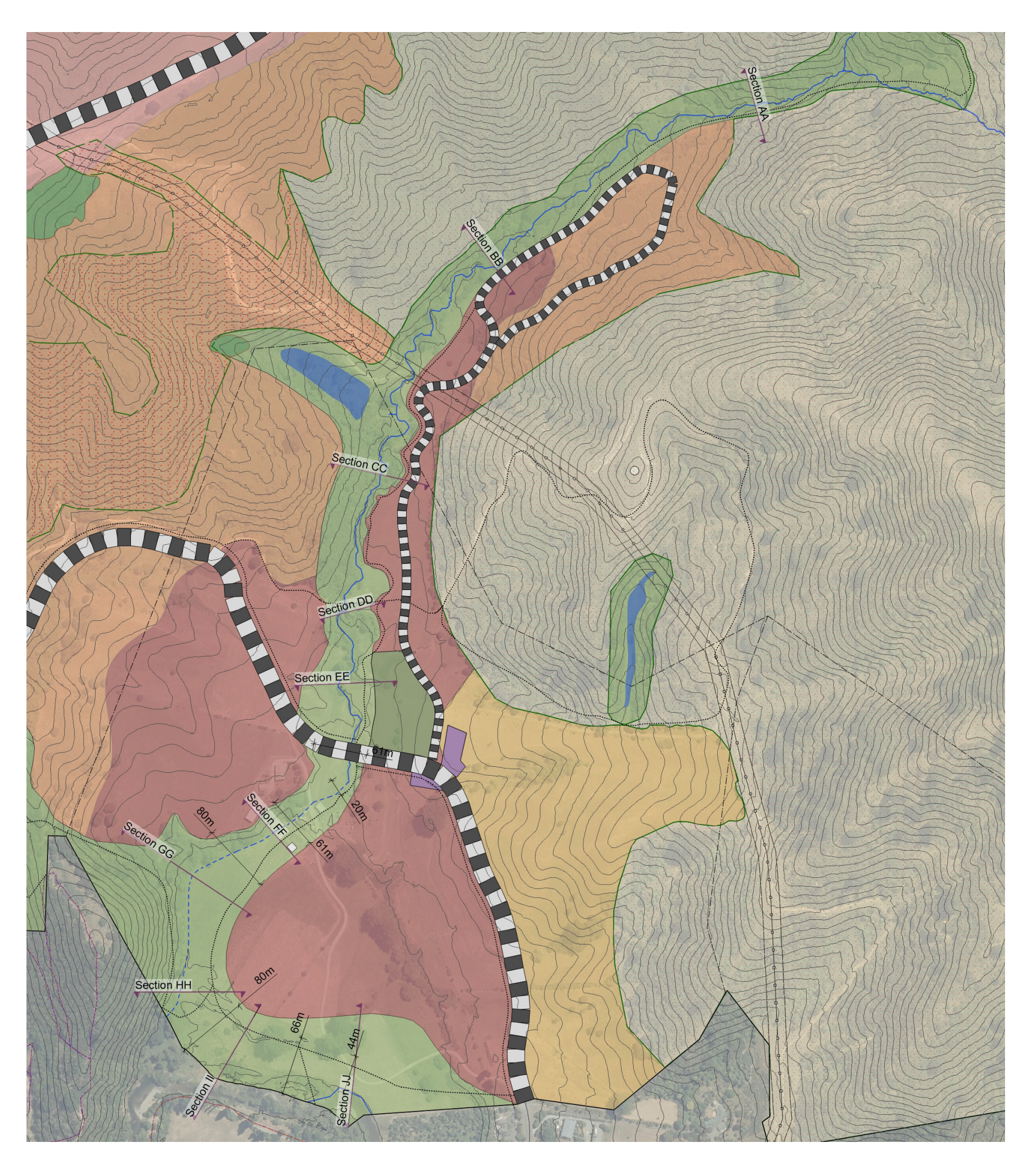
PPC28 Reply Evidence Graphic Attachment