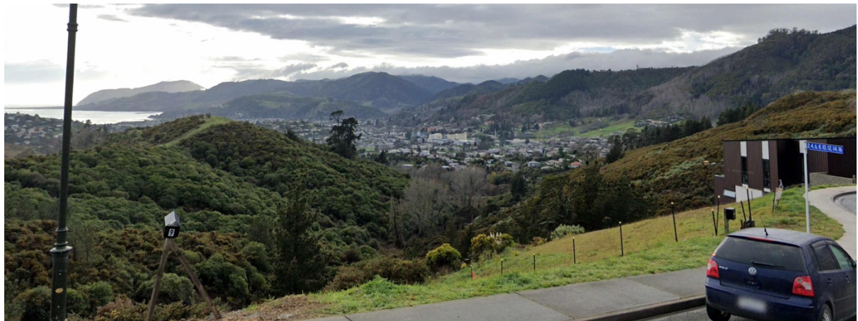
Google Earth Street Views of the Site looking northeast towards the Site from hill suburbs of south Nelson.

The northern section of the ridge - being specifically the undeveloped upper slopes above the existing areas of urban development - and the “clean” natural landform summit ridge/skyline is also valued, mainly as viewed from SH6/Atawhai Drive and across the watery expanse of Nelson Haven, as well as from residential streets and properties in Walters Bluff, Brooklands/Capeview and Bayview, as well as from the Nelson port/marina area.