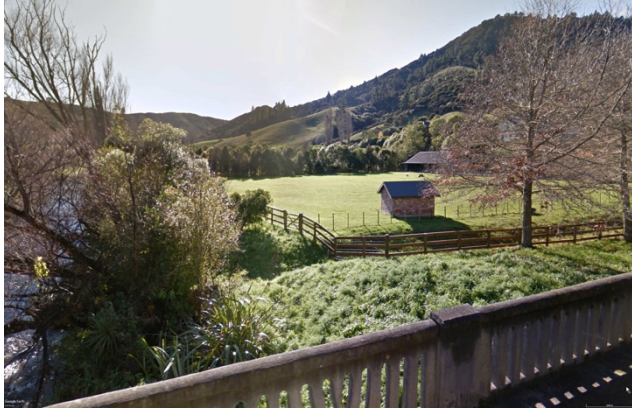
Google Earth Street Views of Kaka Hill from Maitai Valley Road by the cricket ground and from Gibbs bridge.