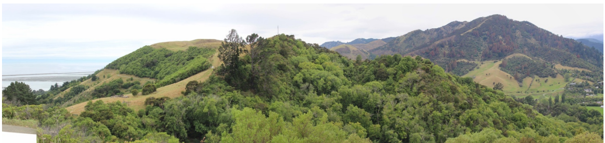
View of Kaka Hill from top of Botanical Hill