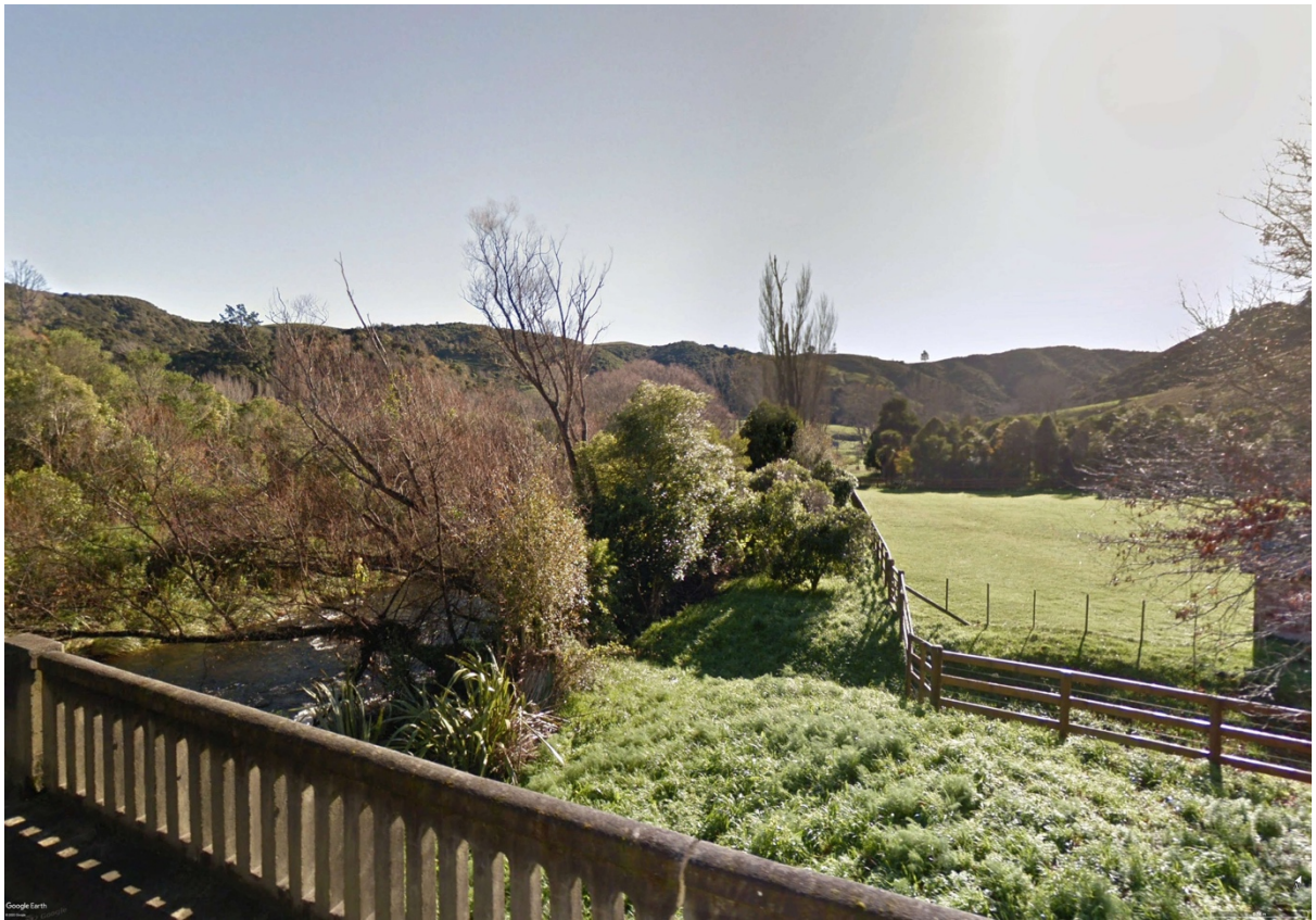
Google Earth Street View into the Site from Gibbs Bridge.