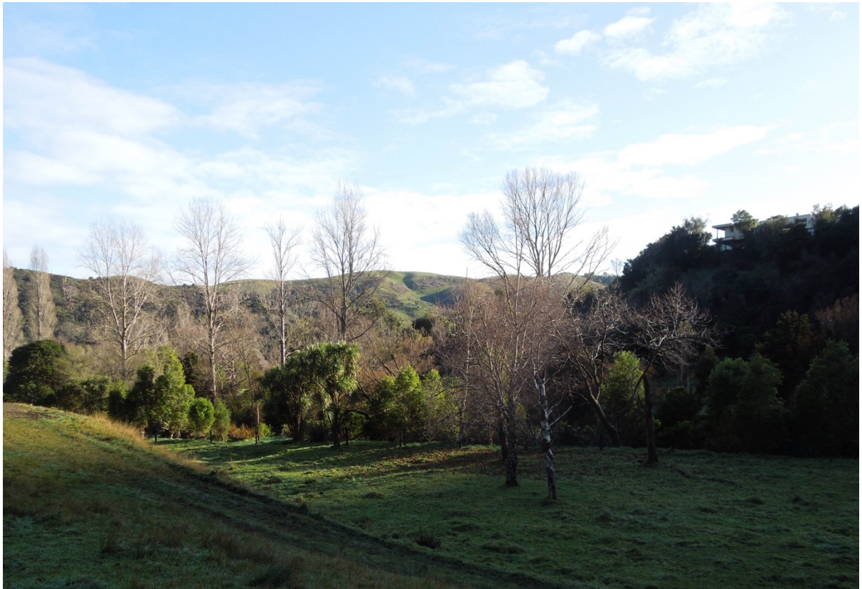
View towards the Site from the true left river reserve and trail. Photo: T Haddon June 2022