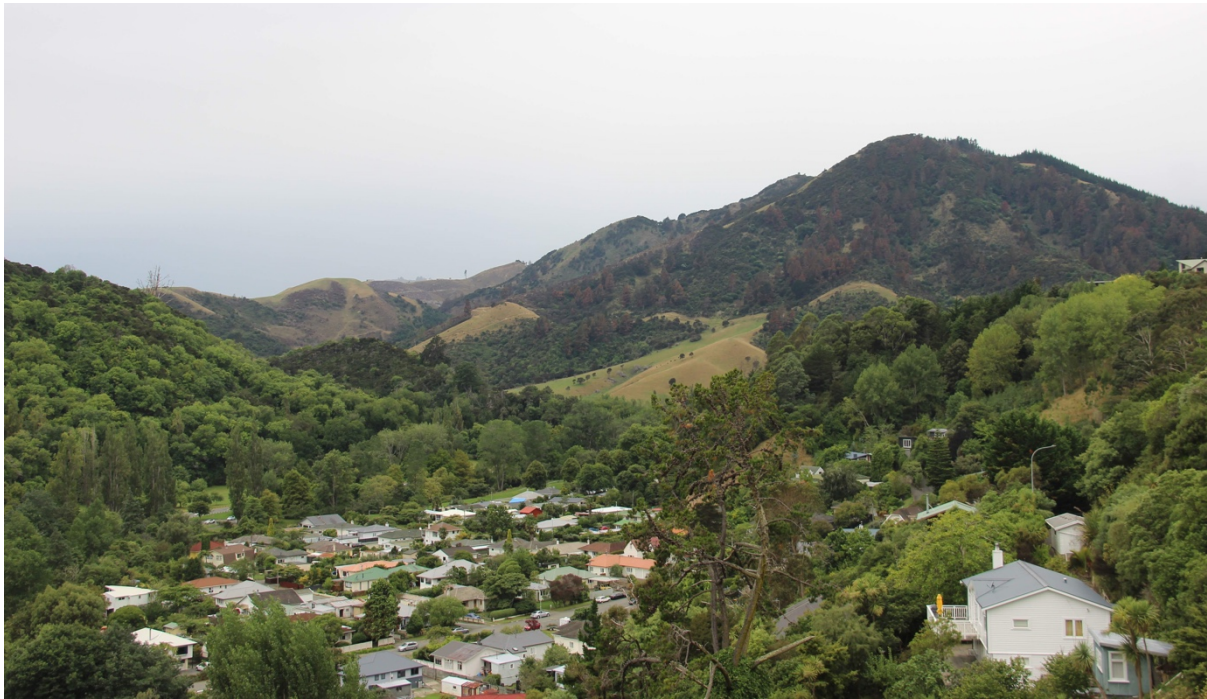
View of the Site and Kaka Hill form Atmore Terrace Photo: A Steven Feb 2022

The second most important value associated with the Site is its role as a highly picturesque or pleasant and peaceful rural to natural setting adding to the quality of recreational experience gained from the Maitai River reserve areas generally; from the Maitai Valley Road as scenic driving and/or en route to other recreational facilities and areas (such as the golf course, or the interior hiking trails); and from Botanical Hill, Branford Park and Olive Hill.