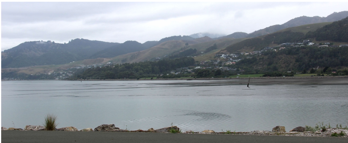
View of the Malvern Hills from the marina Photo: A Steven Feb 2022

As seen in the street view photos in the preceding pages, Kaka Hill is also a distinctive large landform feature highly visible from parts of the urban area forming part of the hill range backdrop as well; and it dominates the view travelling inland (east) along Maitai Valley Road.