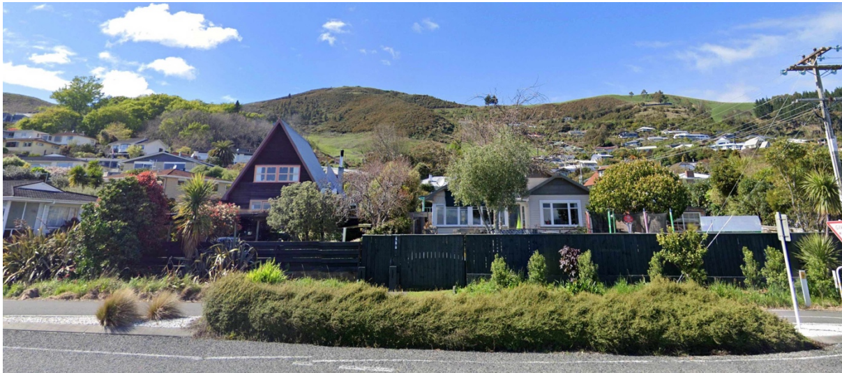
Google Earth Street View directly uphill to Walters Bluff area