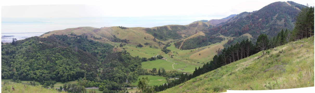
Views north into the Site from the top of Sharlands Hill Photos: A Steven Feb 2022