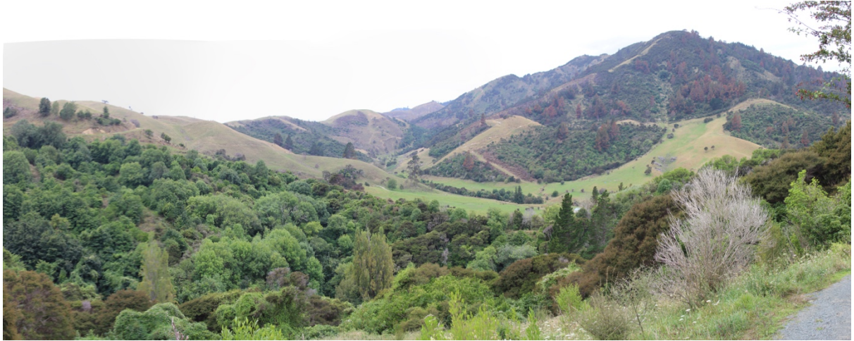
View of Kaka Hill from Branford Park