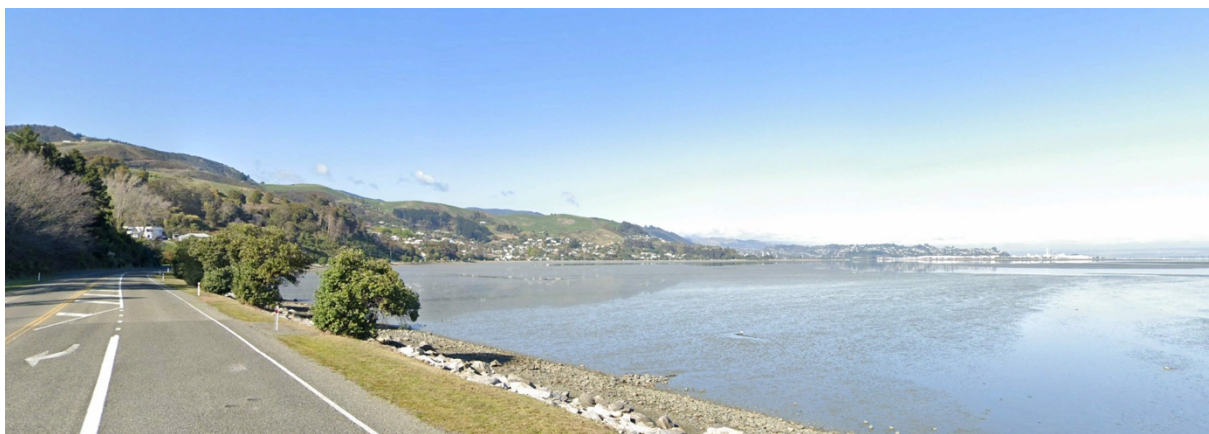
Google Earth Street View towards the Malvern Hills from Atawhai Drive/SH6

The northern section of the ridge - being specifically the undeveloped upper slopes above the existing areas of urban development - and the “clean” natural landform summit ridge/skyline is also valued, mainly as viewed from SH6/Atawhai Drive and across the watery expanse of Nelson Haven, as well as from residential streets and properties in Walters Bluff, Brooklands/Capeview and Bayview, as well as from the Nelson port/marina area.