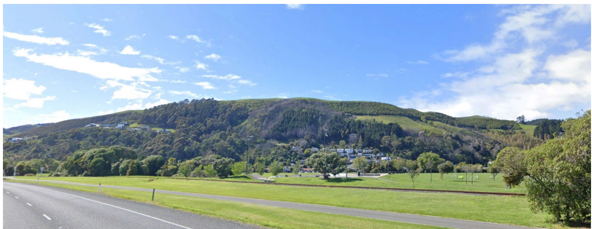
Google Earth Street Views of the southwest side of the Malvern Hills from the central Nelson urban area.