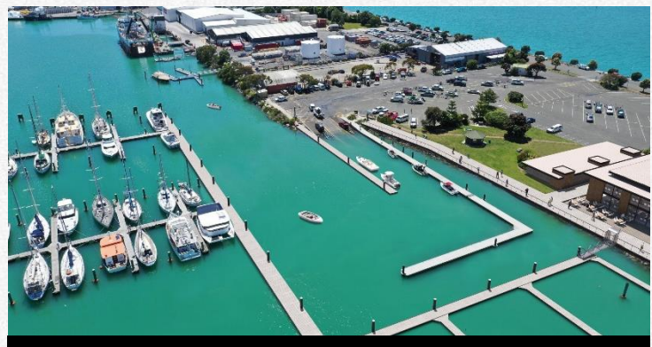
Proposed Waterfront Promenade, Pocket Park Reestablishment and the reconfiguration of the Public Boat Ramp Area