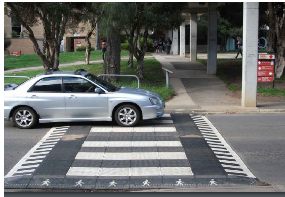
PEDESTRIAN CROSSING SPEED CUSHION NTS

NOTE: DO NOT CONSTRUCT THE CROSSINGS IN THIS ZEBRA CROSSING LAYOUT. CONSTRUCT AS SHOWN IN THE DESIGN